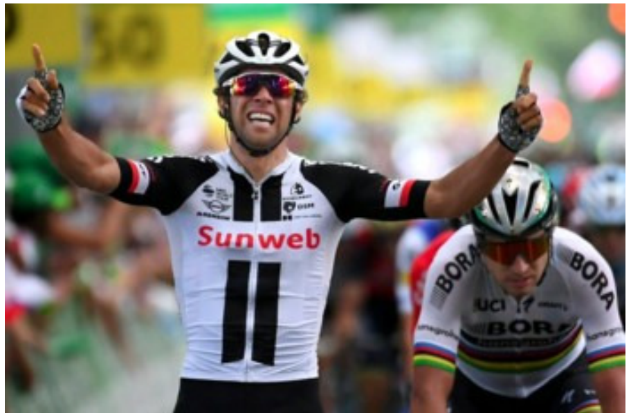
And the big star for the Aussies, Michael Matthews who won the green Jersey becoming the 3 rd Australian to do so.