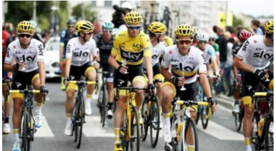
Chris Frome and team celebrate another win in the “tour” Note:- Each rider is holding a celebratory glass of champagne.